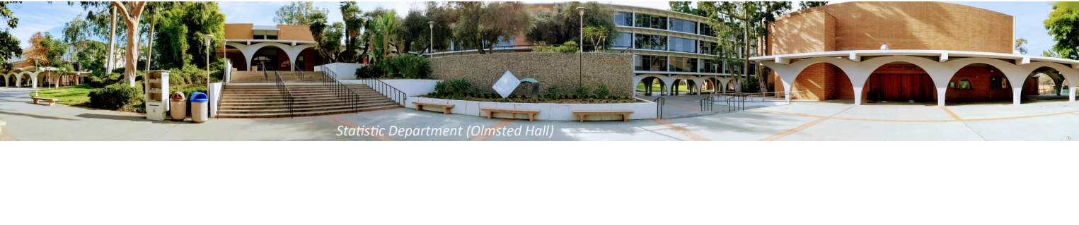
Statistic Department (Olmsted Hall)