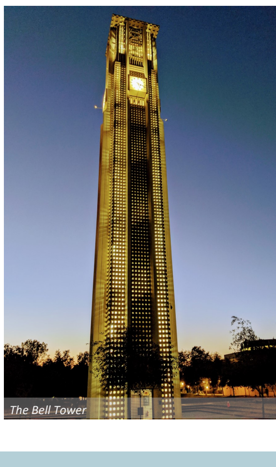
The Bell Tower